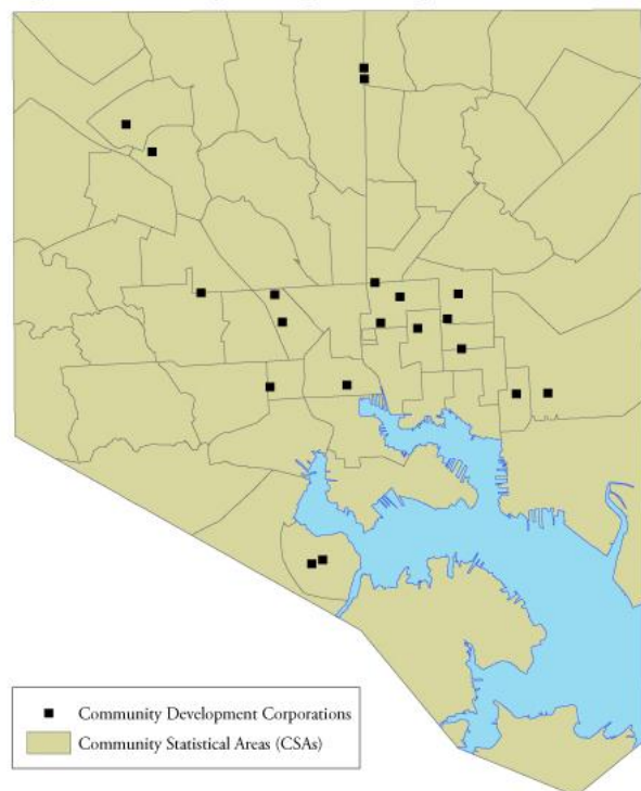
Figure: Community Development Corporations, 2009